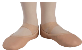
Rising Stars - level II

Skin colored ballet slippers can be worn for students who wish to wear them.