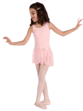
RS /Level I Pink