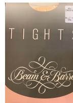
Level III - VII Convertible

Ballet students are also required to wear pink ballet shoes with elastics sewn on.