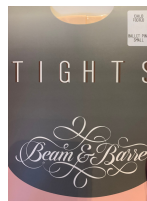
Rising Stars-Level II Footed