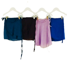
Leveled Ballet Skirts

LEVEL VII STUDENTS CAN WEAR A BLACK LEOTARD OF THEIR CHOICE. LAST SEASON LEOTARDS ARE ALSO ACCEPTABLE.